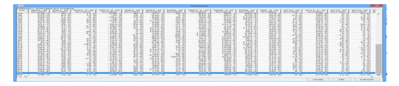
Figure 4.4(a): Spreadsheet of the training microarray dataset