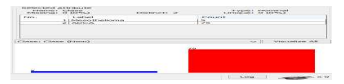
Figure 4.2(a): The testing set contains 80 of tissue samples,5 MPM and 75 ADCA